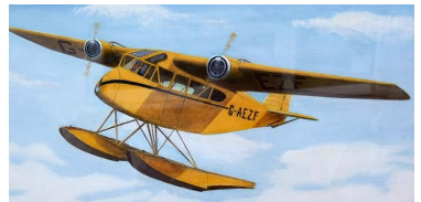
Part of a painting of the first flight of this short scion floatplane in 1937